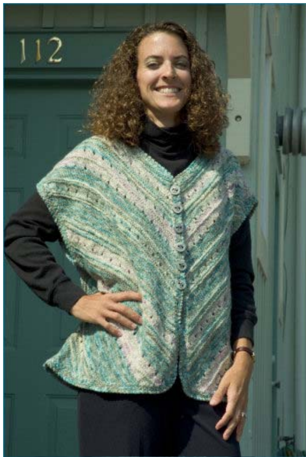
Misty Softwist Wool Vest